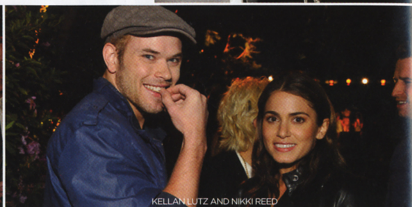
KELLAN LUTZ AND NIKKI REED