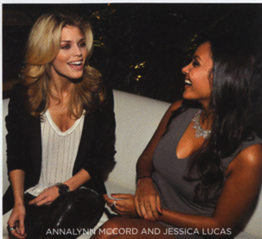
ANNALYNN MCCORD AND JESSICA LUCAS