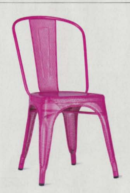
The classic steel Marais chair, designed in 1934 for the French furniture company Tolix, is now available in a perforated, plum-colored metal mesh. $250. Design Within Reach, dwr.com.

Made from a single sheet of creased metal mesh, French designer François Azambourg's Grillage comes in a light blue epoxy lacquer. $1,005 (available early fall). Ligne Roset, 8843 Beverly Blvd., 310-273-5425, ligne-roset-usa.com.