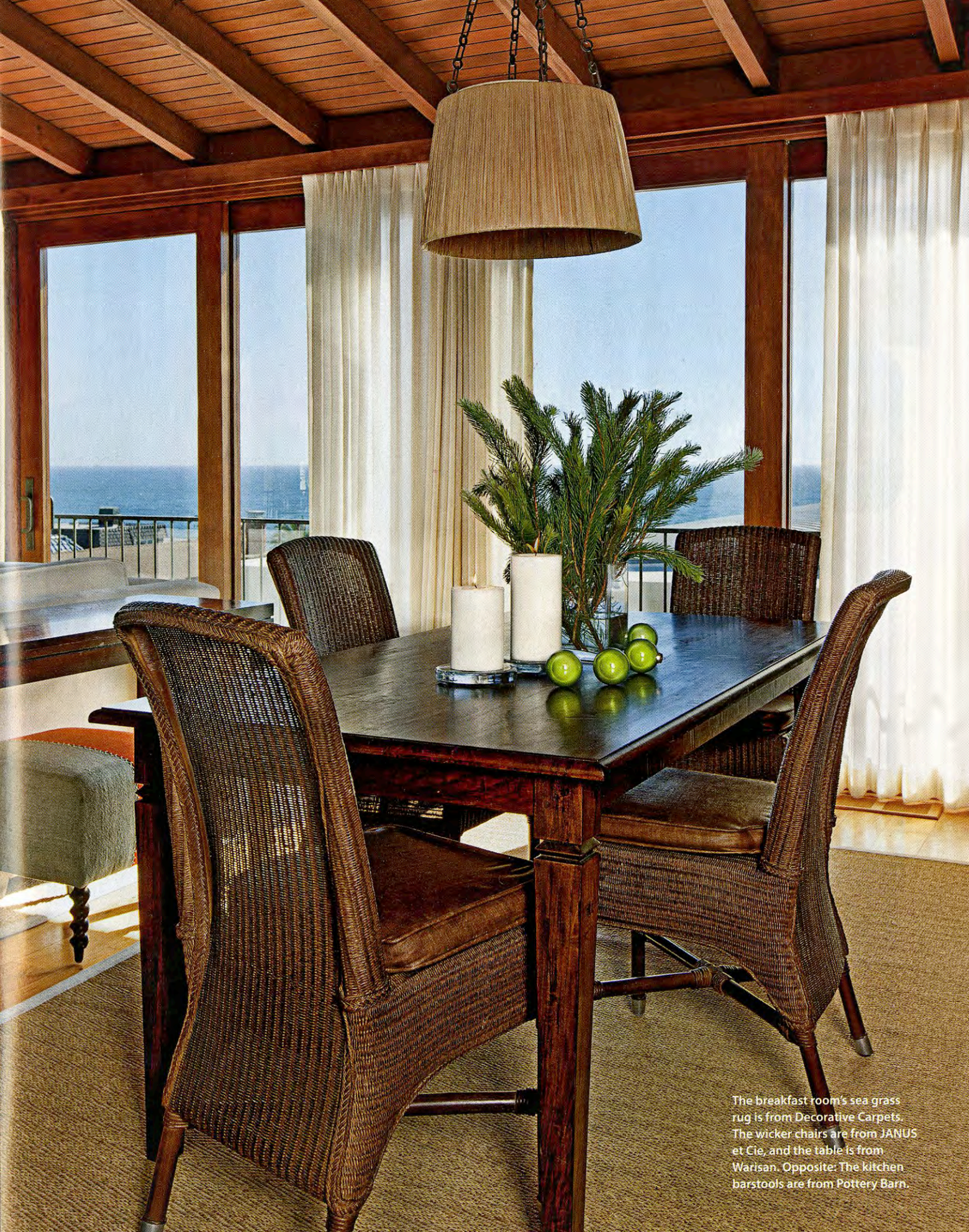
The breakfast room's sea grass rug is from Decorative Carpets. The wicker chairs are from JANUS et Cie, and the table is from Warisan. Opposite: The kitchen barstools are from Pottery Barn.