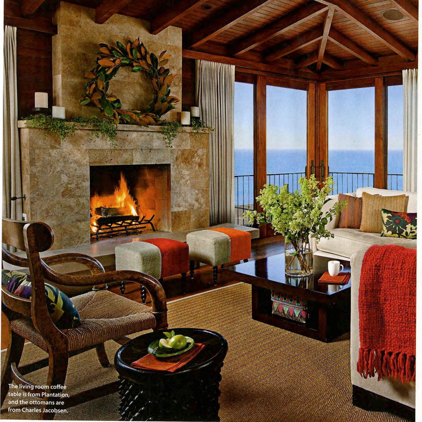
The living room coffee table is from Plantation, and the ottomans are from Charles Jacobsen.

A SoCal design duo creates an Indonesia-inspired refuge for a well-traveled Manhattan Beach family