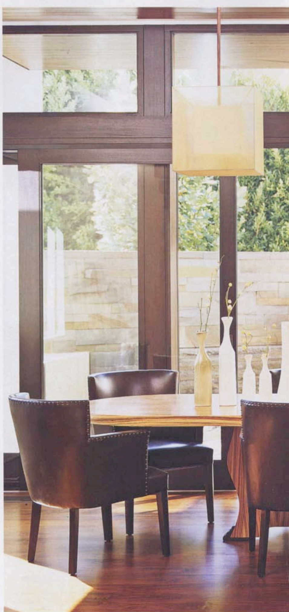
RIGHT: Leather barrel chairs with nailhead trim encircle a massive zebrawood table from Promemoria in the dining room. Box-shaped pendants with organza shades from Foundry Lighting hang above the table, which is dressed with glazed pottery bottles from Silho Furniture in Los Angeles. Mahogany-and-glass doors slide open to a garden area featuring a bluestone-stacked wall and a Japanese maple tree.

The dining room displays a zebrawood table and leather-upholstered barrel chairs designed by Clarke. From this area is a view of a Japanese maple in the garden and a stacked-bluestone wall. "I kept this room simple," he explains. "I didn't want patterned