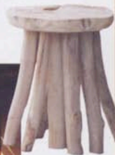
A stump-branch side table from Clarke's retail shop lends an organic, rough-hewn quality to the lanai.

"Mahogany siding, which trims and frames the windows, is dark and beautifully textured," says Evens. "It contrasts with the light-colored plaster."